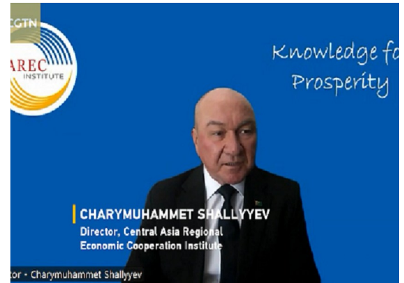
CAREC Institute Director’s Interview with CGTN

The upcoming summit is expected to further deepen economic cooperation and promote sustainable growth across China and Central Asia. Relevant news can be found on the CGTN official website at the following link: https://news.cgtn.com/news/2025-06-15/Trade-expansion-in-Central-Asia-underpins-rise-of-Global-South-1EeqGEVlcFq/p.html