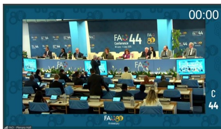
CAREC Institute Participated FAO Roundtable