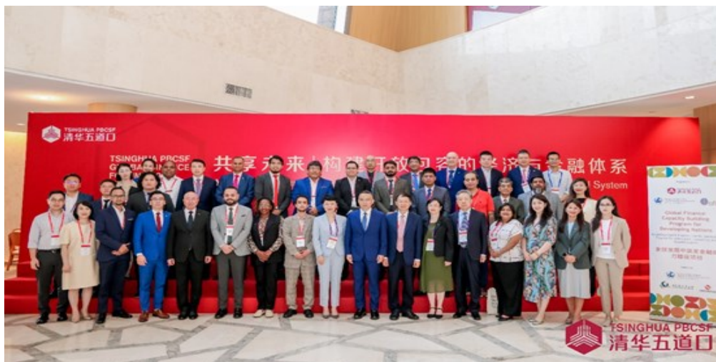
Group photo from the program on digital finance for inclusive growth

The Global Developing Country Finance Capacity Building Program: Emerging Digital Finance Trends—Embedded Finance for Innovation, Inclusivity, and Shared Growth was successfully held from May 17 to 21, 2025 in Shenzhen. The Tsinghua University PBC School of Finance (PBCSF, with PBC referring to the People's Bank of China), the Finance Center for South-South Cooperation, and the Alliance for Financial Inclusion (AFI) co-organized the event.