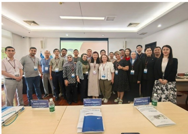
Group photo from the seminar on “Chinese Financial Support for Poverty Reduction and Promoting Inclusive Finance for Central Asia”

In addition, the seminar also supported regional efforts in inclusive finance and sustainable development. It highlighted the CI's role as a hub for knowledge and training. By encouraging dialogue and cooperation, the event helped build economic resilience in Central Asia and reinforced CI's position as a regional advisor.