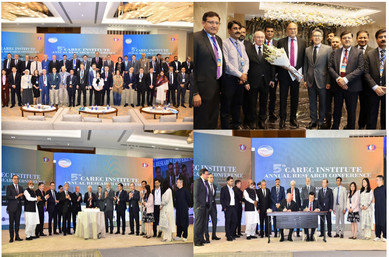
Group photos of the 5th CAREC Institute annual research conference

This year's conference was successfully organized with support from national, regional, and international partners. Their collective effort helped facilitate diverse regional discussions and foster meaningful dialogue among participants.