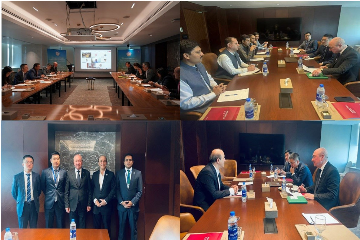
Photos of the side meeting with ADB and Pakistan Institutions

In the afternoon, CI held bilateral meetings with several academic institutions, including the ECO Science Foundation, the University of Sargodha, and the Pakistan Institute of Development Economics. These meetings focused on opportunities for stronger cooperation in areas such as regional trade, digital economy, climate change, and labor migration, as well as institutional development and talent exchange.