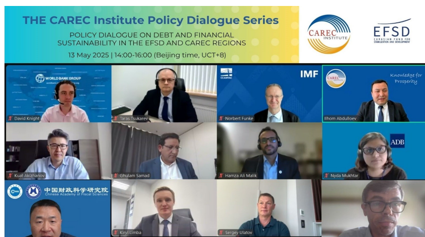
Group photo from the policy dialogue on debt and financial sustainability

The policy dialogue underscored the necessity for policy reforms that extend beyond traditional debt management. By implementing these reforms, countries can bolster their economic resilience and growth potential, paving the way for a more sustainable financial future.