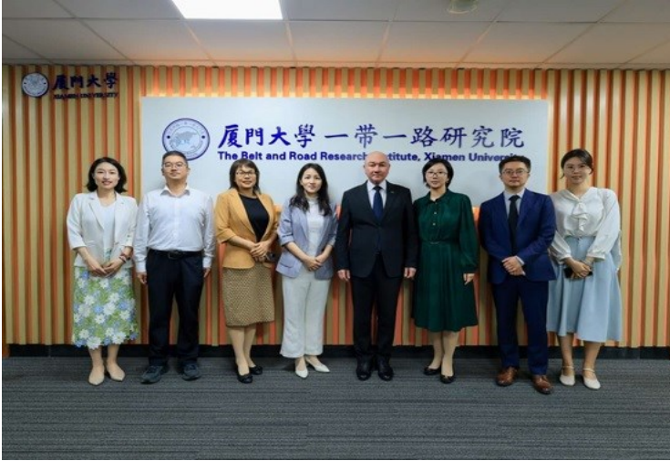
Group photo with the Belt and Road Research Institute, Xiamen University