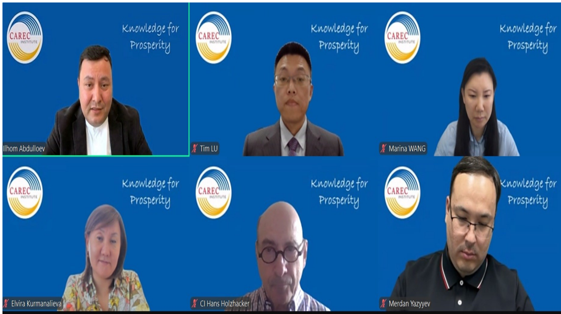
Group photo from the knowledge sharing series on economic monitoring insights in the CAREC region

On 21 May 2025, the CAREC Institute—a knowledge hub promoting economic cooperation and sustainable development in the CAREC region—launched the first session of its Knowledge Sharing Series based on the Quarterly Economic Monitor (QEM) to increase awareness and utilization of its QEM among policymakers, economists, businesses, development partners, and others interested. This would help to facilitate evidence-based policymaking, promote regional cooperation, and support sustainable economic growth.