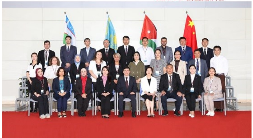
Group photo from the seminar on Chinese Financial Support for Poverty Reduction and Promoting Inclusive Finance for Central Asia