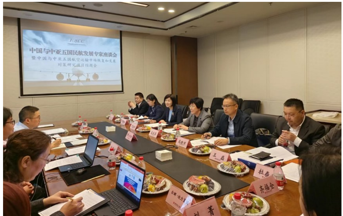
Participants of the webinar on CAREC Institute's new civil aviation research.

The CAREC Transport Strategy 2030 defines air transportation as a key priority for regional cooperation and development. The CAREC Institute's research on Civil Aviation started in 2018 with the support of the International Cooperation and Service Center of the Civil Aviation Administration of China. The current project represents the third phase of research, resulting from an extended long-term collaboration between both parties. As the knowledge hub for the CAREC Program, the CAREC Institute will continue working with all parties to promote inclusive and sustainable air transportation development and continuously promote regional connectivity through knowledge products and services.