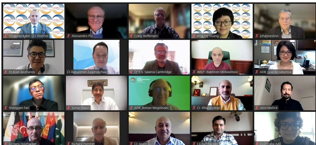
Participants of the CAREC Institute's Advisory Council Meeting.