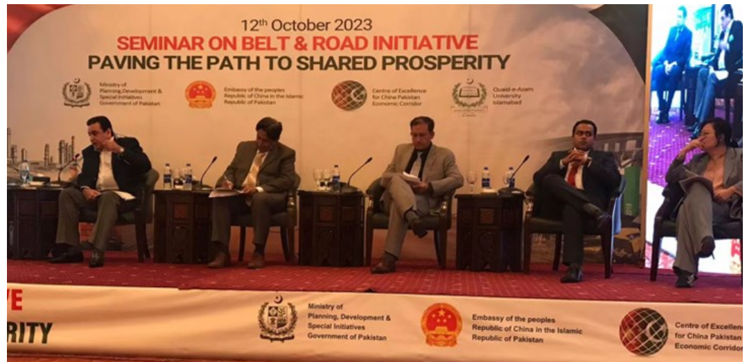
Dr. Ghulam Samad speaks at a Belt and Road Initiative seminar.

interchange. In particular, Pakistan can use CAREC regional cooperation mechanisms to facilitate trade by coordinating and simplifying TIR and non-TIR regimes, upgrading the Sost-Khunjerab Cross Border Point using the AI-enabled Integrated Transit Trade Management System, and deepening cooperation between Rashakai Special Economic Zone in Pakistan and Kashi Economic Development Zone in China. The CAREC Program supports policy coordination, cross-border trade, and the integration of regional networks to enhance trade and industrial cooperation. In turn, the CAREC Institute, as the knowledge hub of the CAREC Program, supports the regional economic cooperation through knowledge generation and sharing, capacity building and research partnerships.