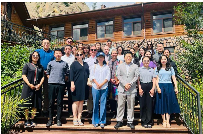
Participants of the workshop on industrial policy for Mongolia, Ulaanbaatar, Mongolia.

Participants of the workshop discussed international best policy practices for industrial diversification, newly emerging sectors, and development of small and medium enterprises. Experts from the Korea Institute of Industrial Economics and Trade (KIET) highlighted the Korean experience. A special section of the workshop was devoted to UNIDO's Evidence-Based Industrial Policymaking and the Enhancing the Quality of Industrial Policies Toolkit, where participants learned how to map the existing industrial policies, to identify policy gaps, duplications, missed synergies, etc., considering the best practices from other countries, and to advocate for industrial policy improvement.