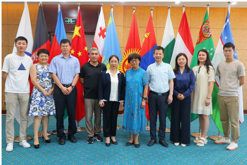
Meeting with the delegation from Shanghai University of Electric Power.