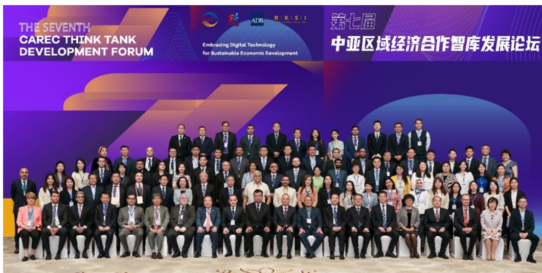
Participants of the Seventh CAREC Think Tank Development Forum in Urumqi, the PRC.