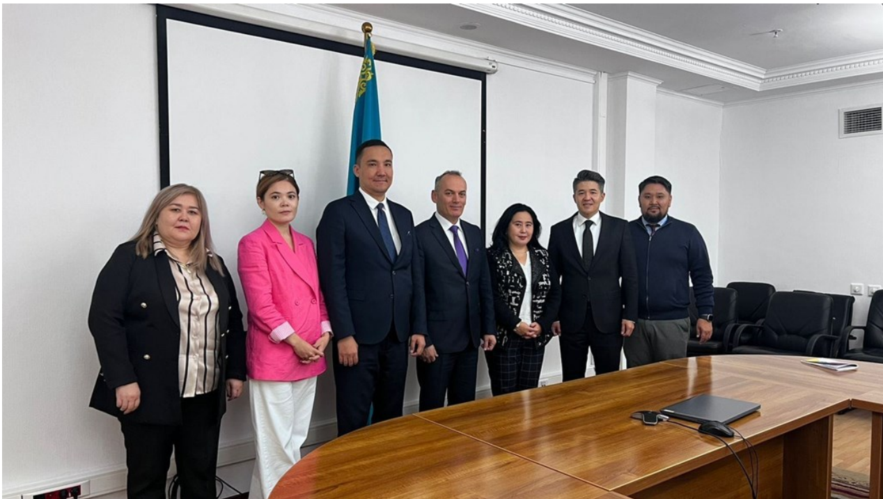
Meeting with CAREC Focal Persons in Kazakhstan.

Further, the meeting participants discussed organizational issues related to the holding of the CAREC Ministerial Conference and meetings of the Governing Council and the Advisory Council of the CAREC Institute, as well as issues of voluntary financial contributions by member countries for the production of a new and wide range of knowledge products and services by the CAREC Institute.