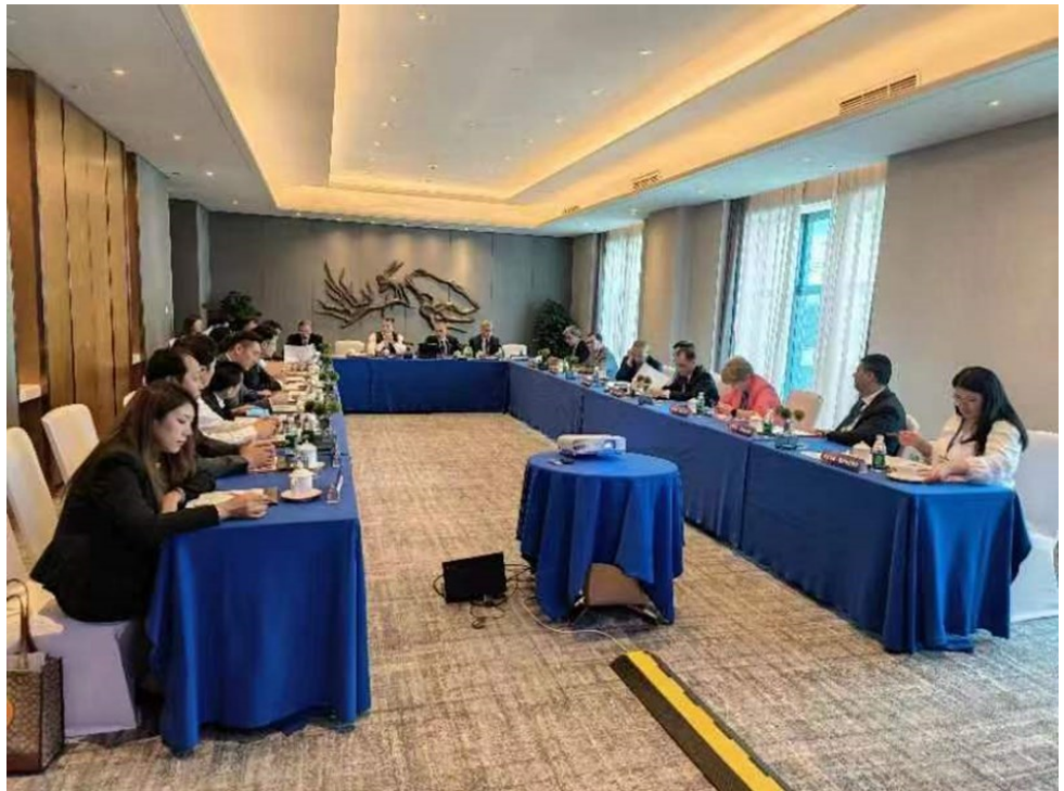
Discussion between representatives of governments of CAREC member countries and private enterprises.