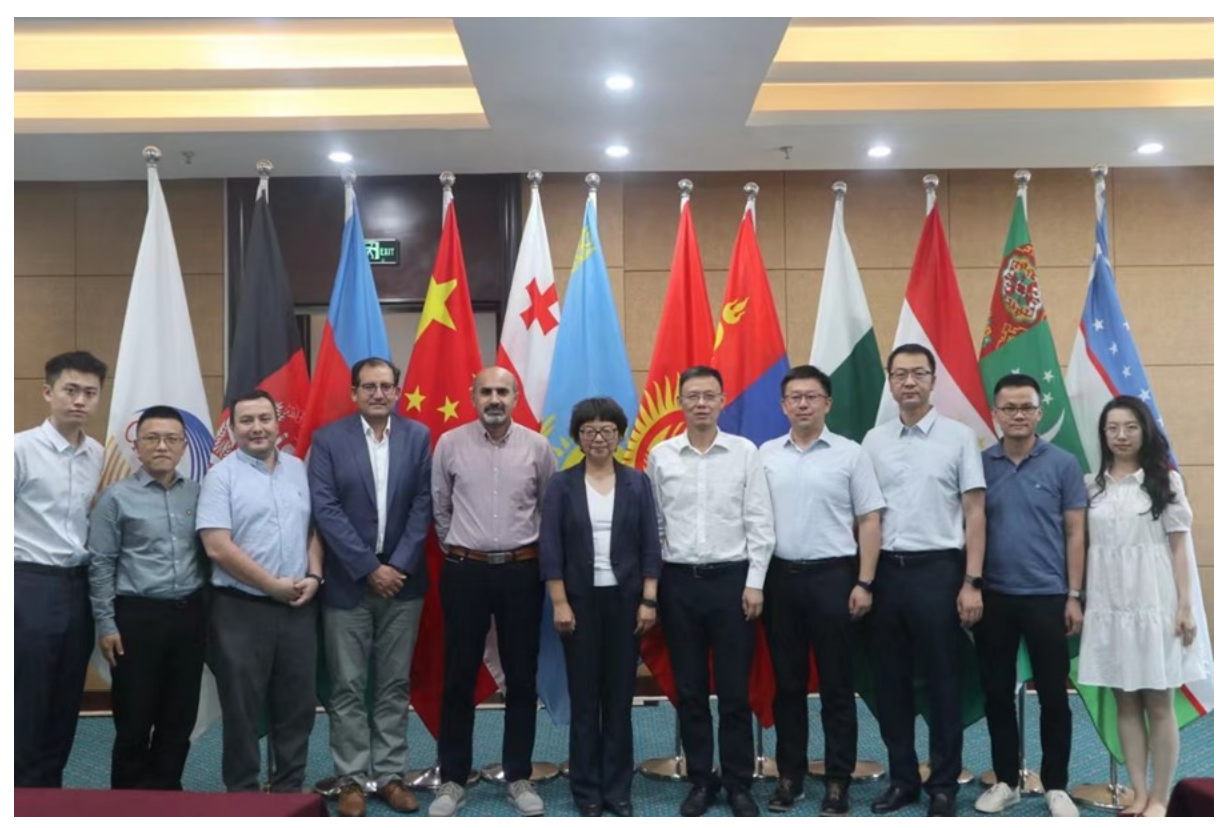
Meeting with the delegation from the China Development Bank.

Both sides agreed to hold regular meetings to discuss further cooperation in research and capacity building.