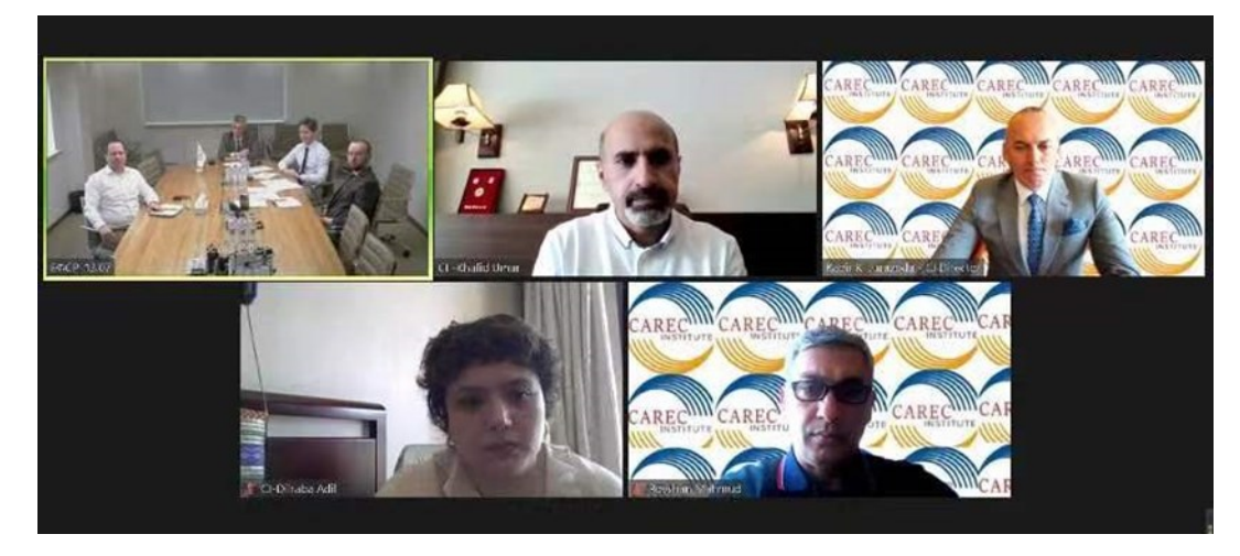
Partnership meeting with the Eurasian Fund for Stabilization and Development.

As a regional knowledge broker, the CAREC Institute partners with national and international partners to provide high-quality research and capacity-building services and knowledge products which can be translated into effective policy actions for the benefit of countries in the CAREC region.