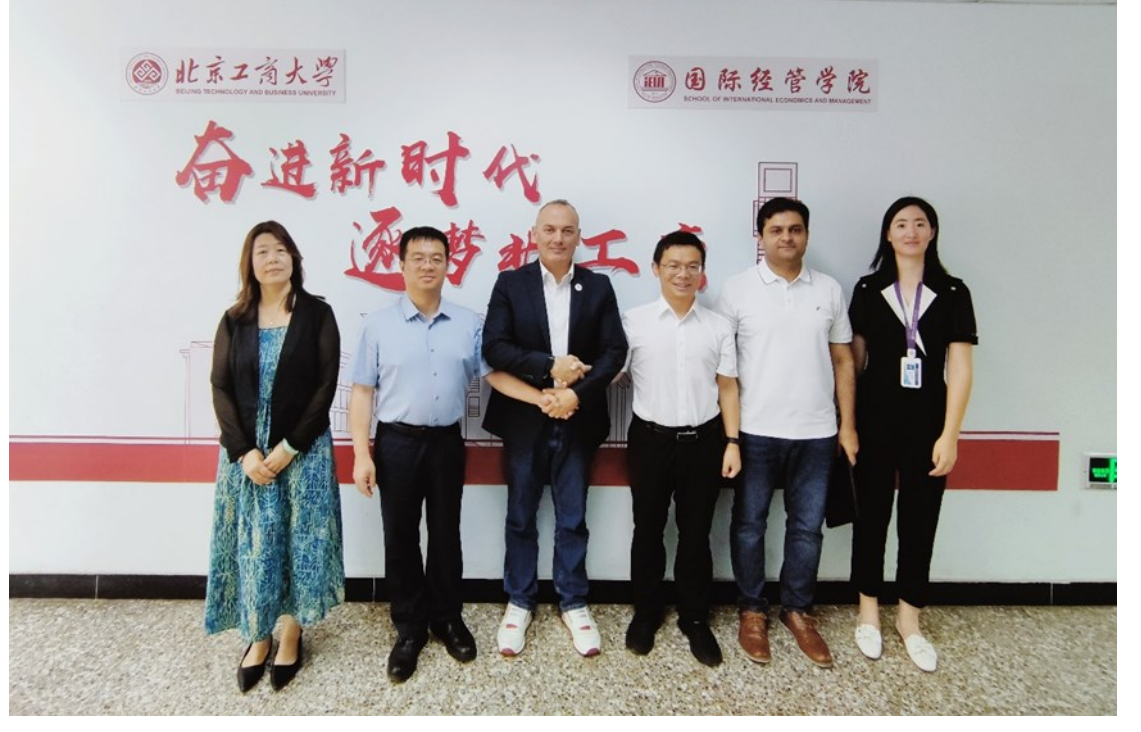
Partnership meeting with the School of International Economics and Management, BTBU.

Both sides discussed in detail the issues of cooperation, team building and writing a policy report on Digital Wisdom Tourism and agreed to further promote the Belt and Road Initiative, the Global Development Initiative, and the United Nations Sustainable Development Goals as important basis for practical cooperation among CAREC countries.