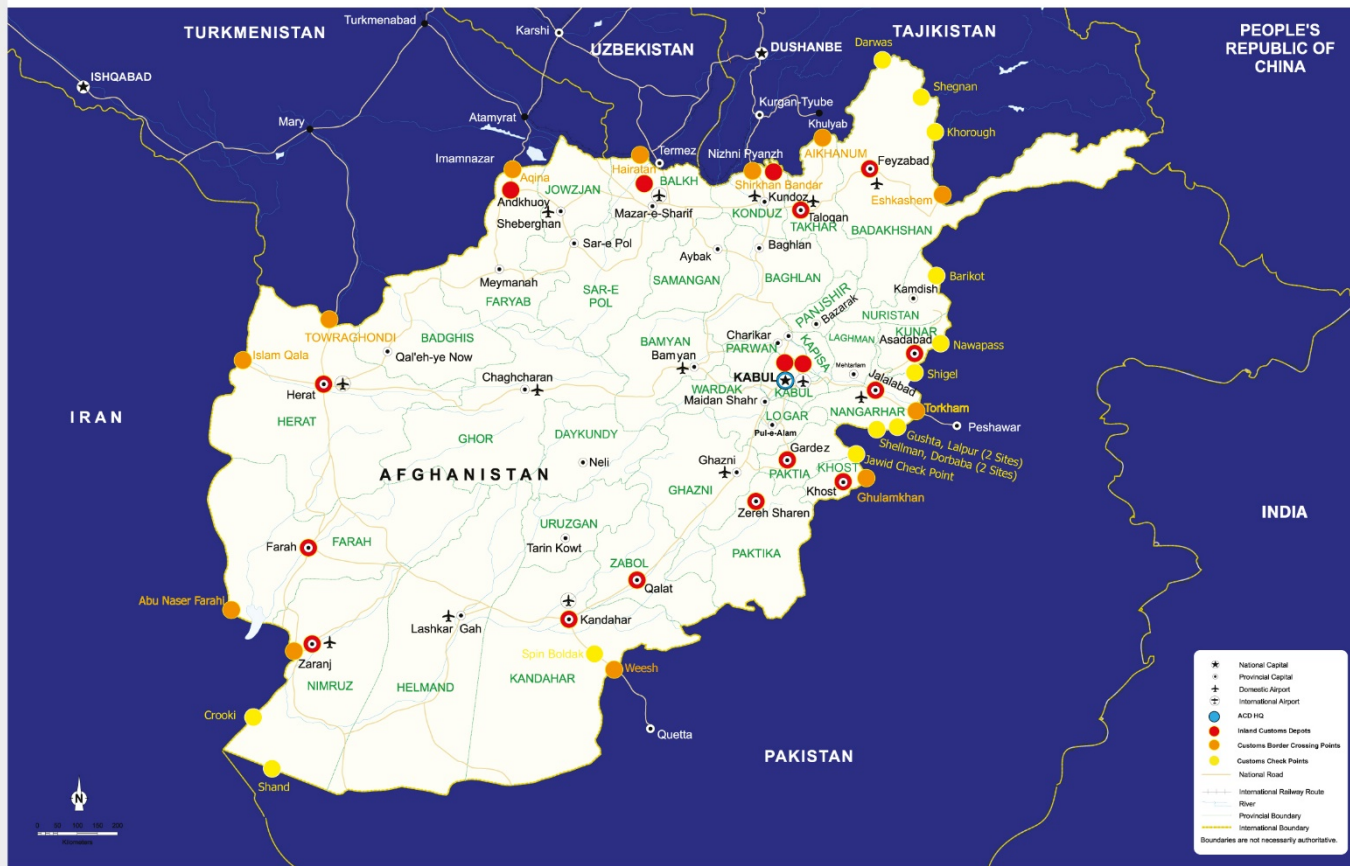
Afghanistan Inland Customs Depots, Customs Border Crossing Points and Customs Check Points

Afghanistan has 11 official border crossing points and 17 inland customs depots or offices . They operate through the year but does not operate 24 hours. Most open for 6 days and are closed on Friday. There are strictly no night movements due to security.